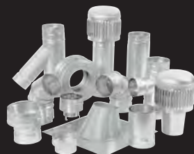
TYPE-B GAS VENT