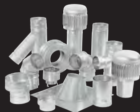
TYPE-B GAS VENT