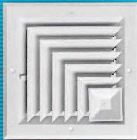
Sidewall/Ceiling Diffuser Corner

Available in six sizes: 6x6, 8x8, 10x10, 12x12, 14x14