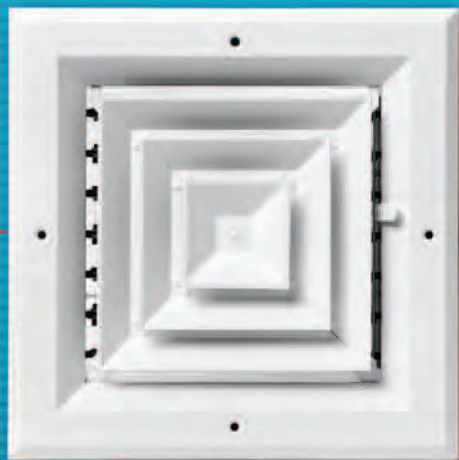
Sidewall/Ceiling Diffuser 4-way