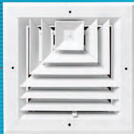
Sidewall/Ceiling Diffuser 3-way