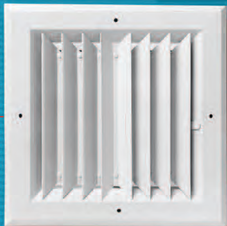
Sidewall/Ceiling Diffuser 2-way